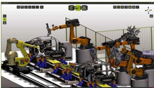
Figure 2 Inserting real objects into virtual space

There are producers who transmit 3D models to the production hall layout by placing them in work cells. However, there is no real integration and connection between the virtual model and the physical product in the factory. Here, the model serves only as a reference, and one has to do with the connection between the virtual and the physical product on an ad hoc basis.